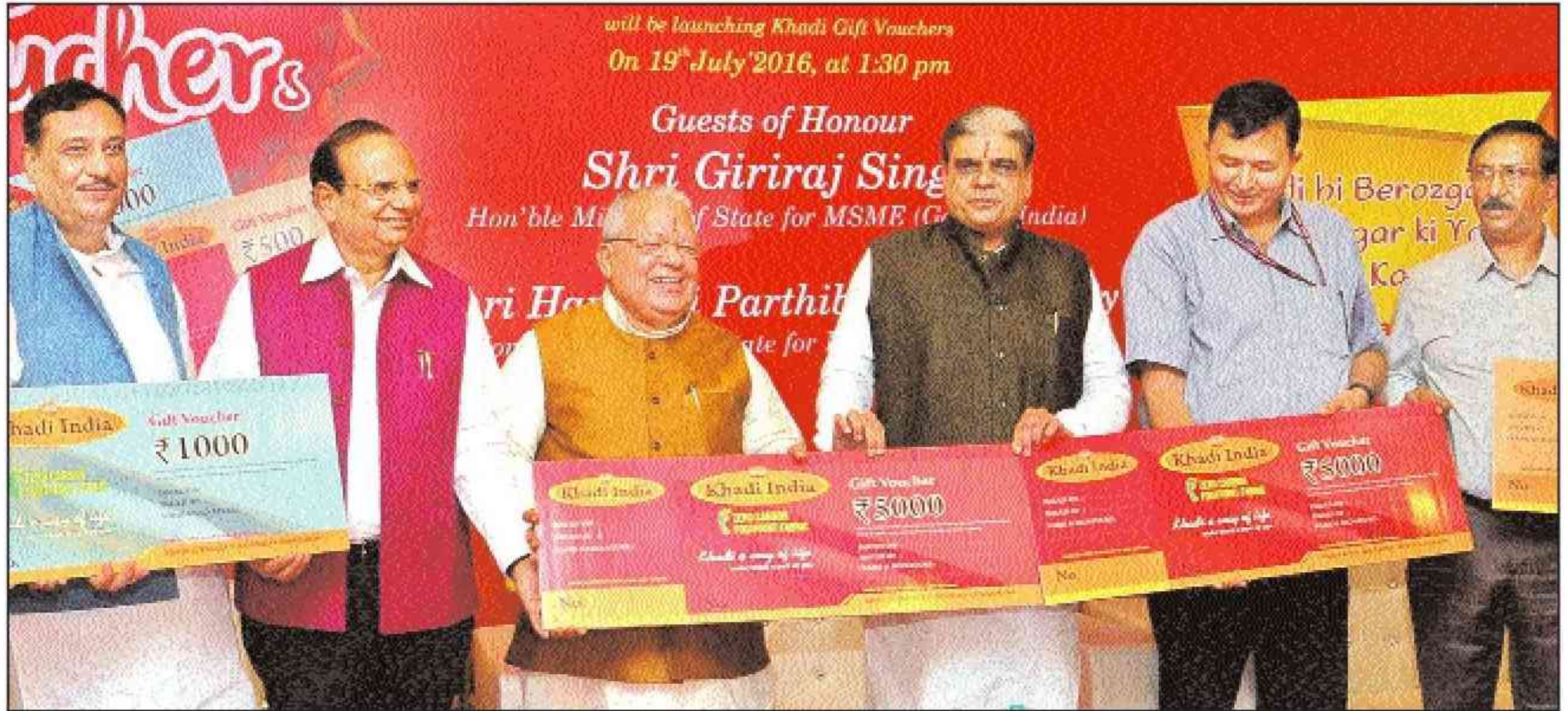
खादी वस्त्र व अन्य उत्पादों को प्रमोट करने के लिए गिफ्ट वाउचर लांच करते एमएसएमई मंत्री कलराज मिश्र।