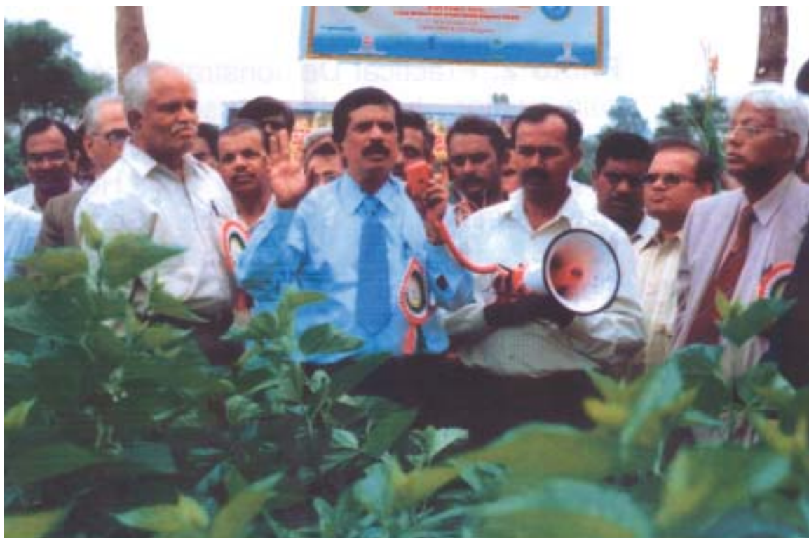
Practical demonstration of technologies like rain water harvesting, use of organic manure, preparation of vermicompost, etc., to the delegates attending the workshop on “Soil Health and Water Management for Sustainable Sericulture” held at Regional Sericultural Research Station Kodathi, Karnataka.

deals with muga and ericulture. The Regional Sericultural Research Station (RSRS / RTRS) for mulberry and non-mulberry disseminates research findings and tackles the regional field issues of the industry. Besides, a network of Research Extension Centres (REC) & its sub-units for mulberry and non-mulberry provide extension support to sericulturists. To provide R&D support in the post-cocoon sector, the Board has established the Central Silk Technological Research Institute (CSTRI) at Bangalore, the Silkworm Seed Technology Laboratory (SSTL) at Bangalore, the Central Sericultural Germplasm Resources Centre (CSGRC) at Hosur (Tamil Nadu), and the Seri-Biotech Research Laboratory (SBRL) at Bangalore.